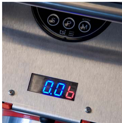
Figure 3. Pressure readout in bar.